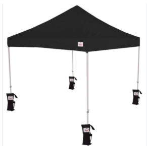
Examples of Tents & Weights